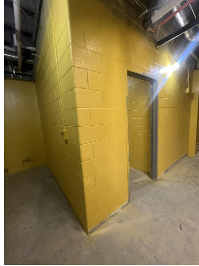
Painting in the kitchen on level 1.