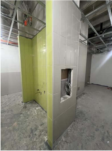
Installing ceramic tiling in restrooms on level 1.