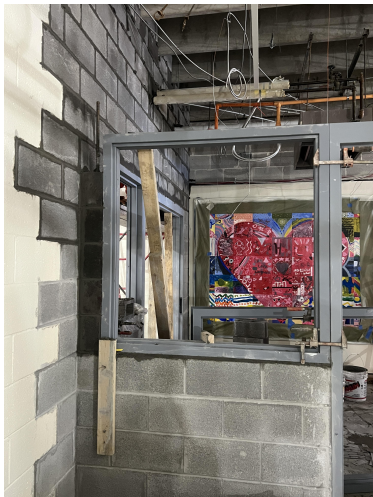
Installing CMU and a door frame in the corridor on level 2.